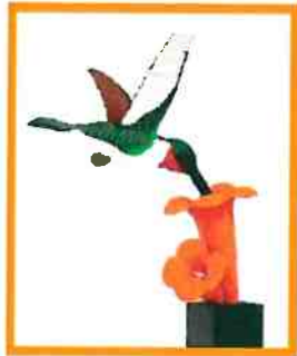
HUMMINGBIRD $5,000 LOCATION: RANGE OF THE JAGUAR