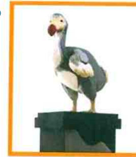
DODO BIRD $5,000 LOCATION: ASIAN BAMBOO GARDEN