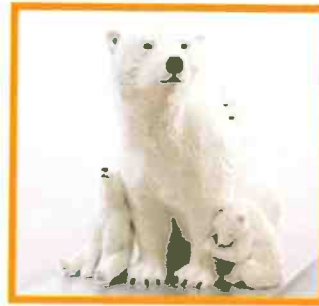
POLAR BEAR AND CUBS $10,000 LOCATION: MAIN CAMP