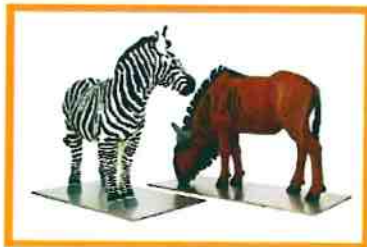
ZEBRA AND WILDEBEEST $7,500 LOCATION: SAVANNA BLOOMS GARDEN