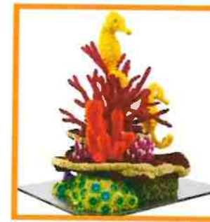
SEAHORSE AND CORAL REEF $5,000 LOCATION: PLAY PARK