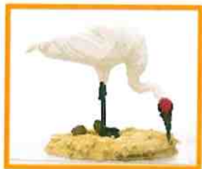
WHOPPING CRANE $5,000 LOCATION: ASIAN BAMBOO GARDENS