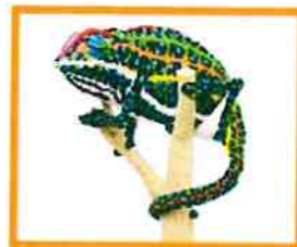
CHAMELEON $5,000 LOCATION: RANGE OF THE JAGUAR