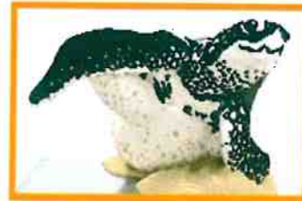
SEA TURTLE $5,000 LOCATION: PLAY PARK