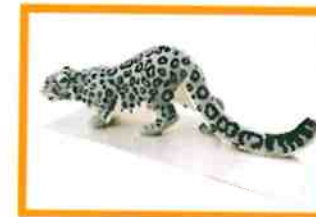
SNOW LEOPARD $5,000 LOCATION: ASIAN BAMBOO GARDEN