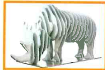
DISAPPEARING RHINO $5,000 LOCATION: SAVANNA BLOOMS GARDEN